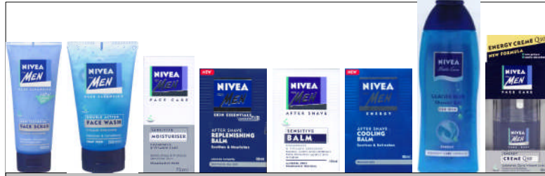
SHELF 5 1m14.00cm