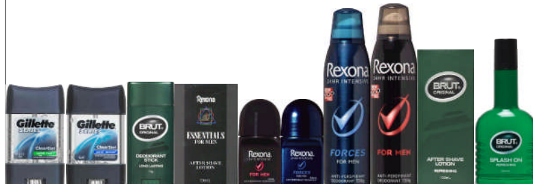
SHELF 2 39.00cm