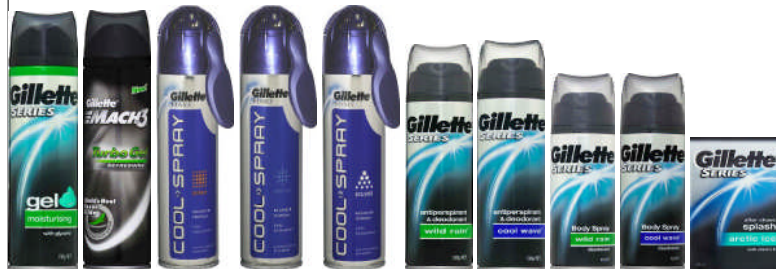
SHELF 3 64.00cm