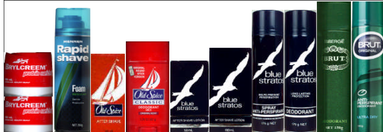
SHELF 1 15.00cm