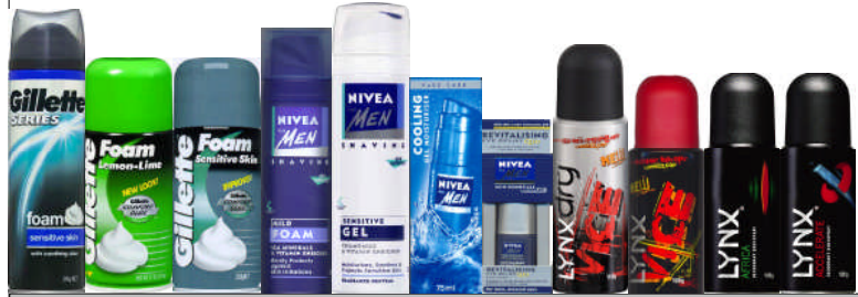
SHELF 4 88.72cm